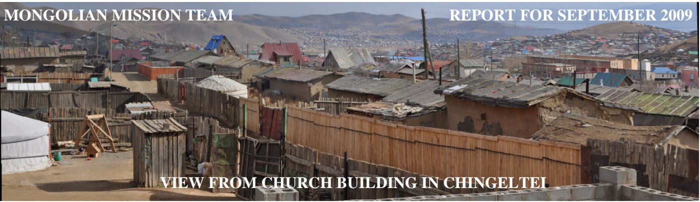
VIEW FROM CHURCH BUILDING IN CHINGELTEI